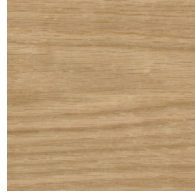
Oak Natural - OAK